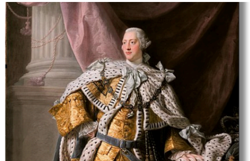
King George III

It was important for George Washington to encourage unity and caution because he wanted to remind everyone that working together makes the country stronger. When we cooperate and think carefully about our choices, we help keep ourselves and others safe. By doing this in our own lives, like helping a friend or being careful when playing, we contribute to a positive environment. By choosing to step down after two terms, George Washington set a great example for future presidents. He showed that it was important to put the country first and that sometimes, it's good to let someone else take the lead. Washington also knew that as the first president, he would set an example for future presidents. If he were to die while in office, people might think that presidents were elected for life, just like kings.