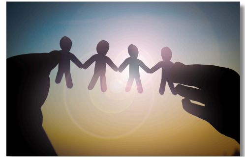
working together & cooperation

It was important for George Washington to remind the people about working together because a strong nation depends on unity and cooperation. When everyone cares for their country and supports each other, it builds a better future. Washington understood that his experiences as president could provide valuable lessons for everyone, helping them to work together even after he stepped down.