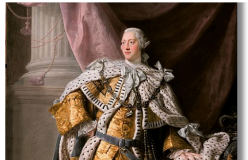
King George III

It was important for George Washington to encourage unity and caution because he wanted to remind everyone that working together makes the country stronger. When we cooperate and think carefully about our choices, we help keep ourselves and others safe. By doing this in our own lives, like helping a friend or being careful when playing, we contribute to a positive environment. By choosing to step down after two terms, George Washington set a great example for future presidents. He showed that it was important to put the country first and that sometimes, it's good to let someone else take the lead. Washington also knew that as the first president, he would set an example for future presidents. If he were to die while in office, people might think that presidents were elected for life, just like kings.