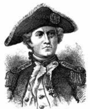
Lieutenant John Paul

On December 3, 1775, something exciting happened that changed things for the American colonies. A brave man named Continental Navy Lieutenant John Paul Jones did something really important. He was on a ship called the Alfred, which was in the Delaware River. Lieutenant Jones decided it was time for a new flag, one that was different from Great Britain's flag.