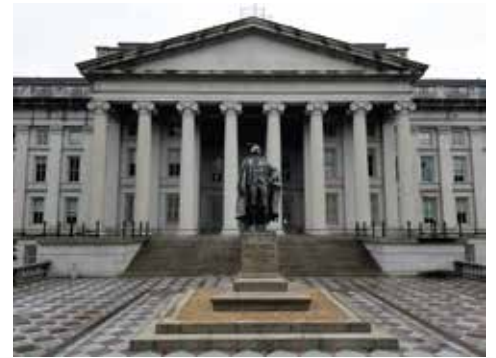
U.S. Department of the Treasury

They also keep track of how much money the government has and how much it owes. Plus, they make sure everyone follows the rules when it comes to money and taxes.