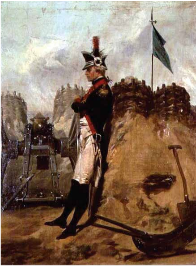
Young Alexander Hamilton