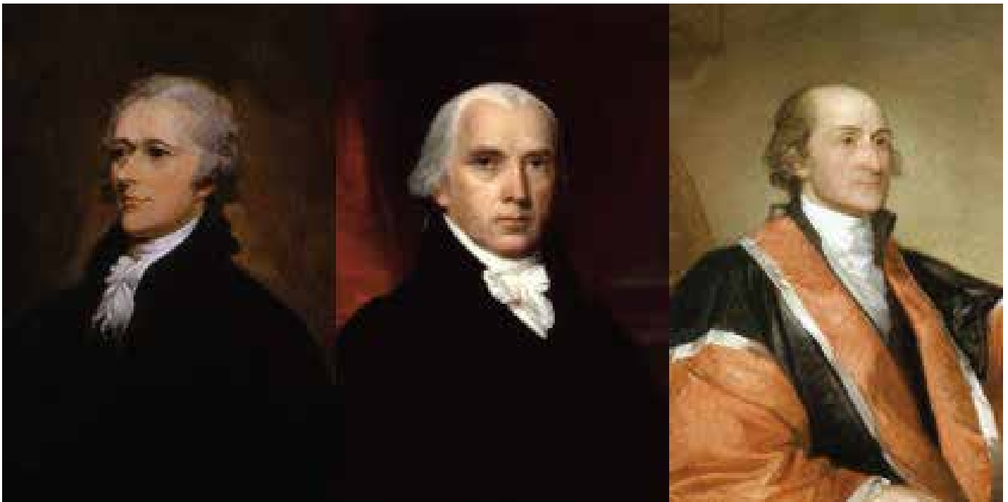
Alexander Hamilton, James Madison, and John Jay