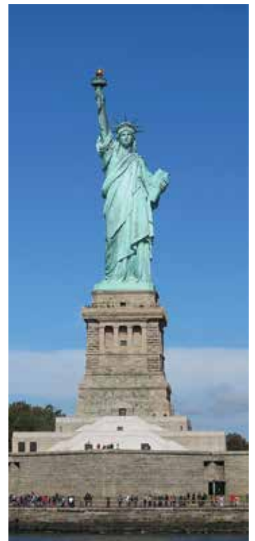
Statue of Liberty