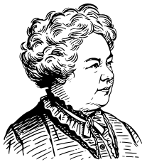
Elizabeth Cady STANTON

Directions: Help Elizabeth Cady Stanton find Lucretia Mott so they can join forces and fight for women's right to vote.