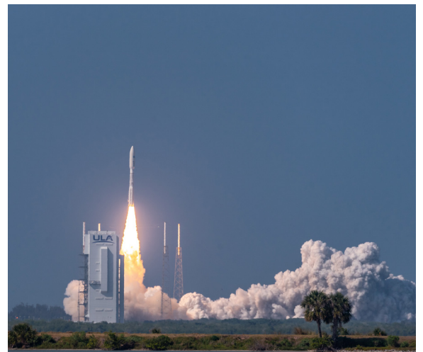
First U.S. Space Force launch, March 2020.

In America, we have special days to honor the amazing people who keep us safe and protect our freedom. Two of the most important days are Memorial Day and Veterans Day. Memorial Day happens on the last Monday of May. We remember and thank the brave soldiers who gave their lives fighting for our country. Veterans Day is on November 11th. We honor all the living heroes who served in the military but didn't lose their lives in battle.