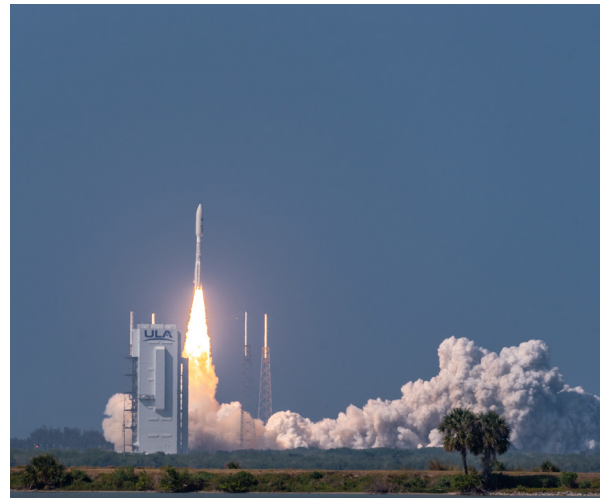
First U.S. Space Force launch, March 2020.

This war's impact on our nation cannot be overstated. When the war began, America was in debt and struggling to recover from the Great Depression.