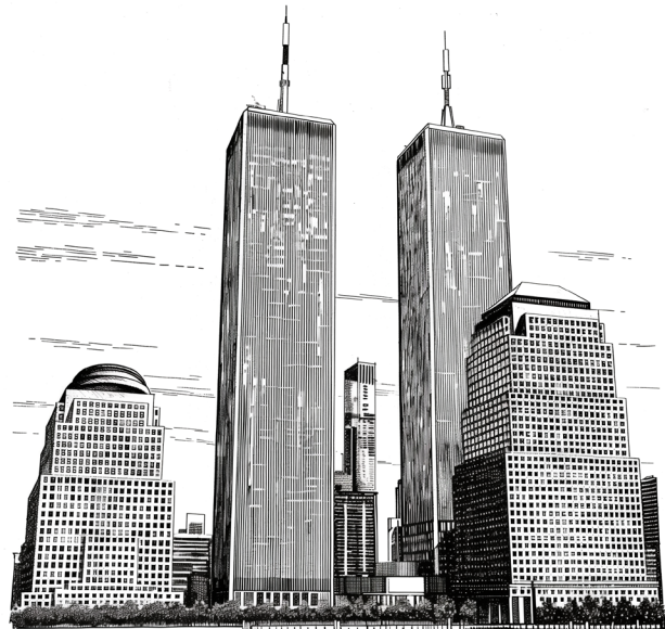
World Trade Center