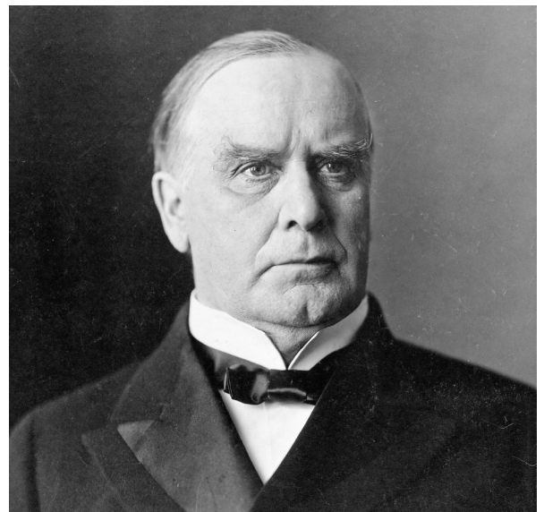
President William McKinley

Despite knowing they were unlikely to win a war against the United States, the Spanish government believed it was preferable to face defeat in a war rather than risk a rebellion from within.