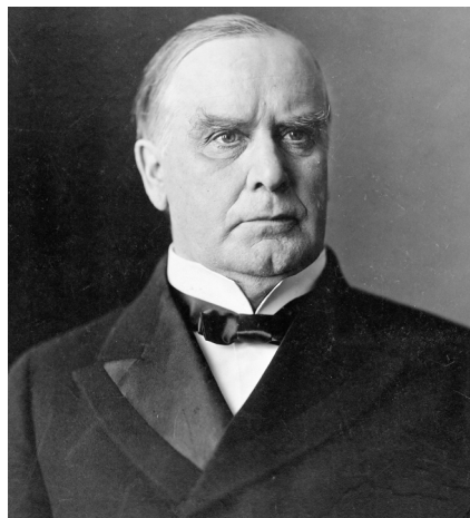
President William McKinley