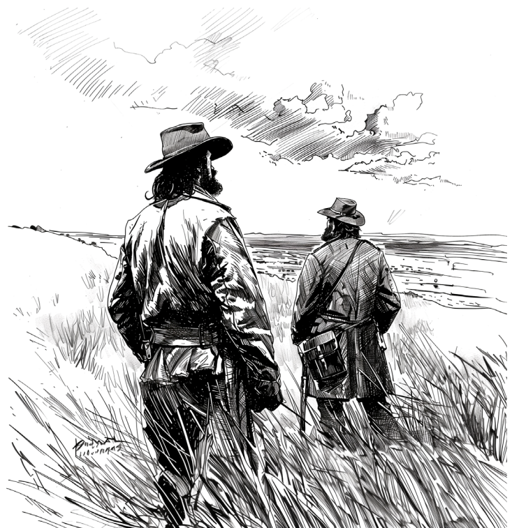
Lewis and Clark

If people who lived before our time did not choose to be brave and explore the unknown, we would know very little about the world around us!