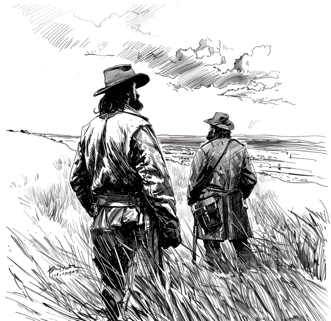
Lewis and Clark