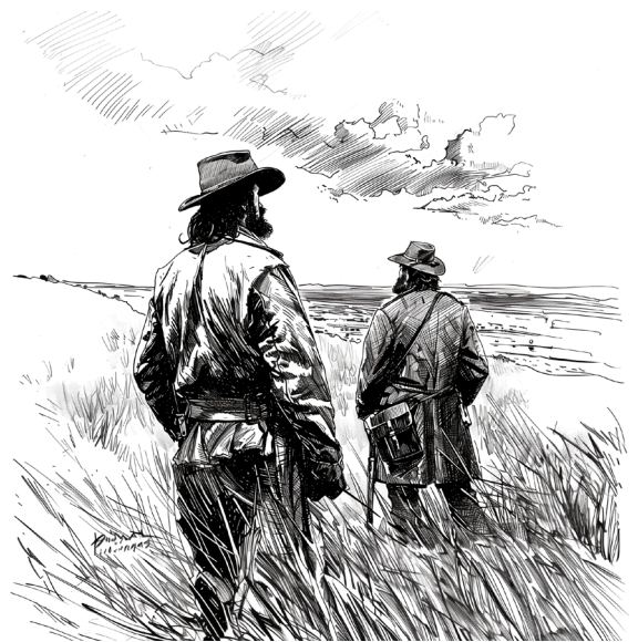
Lewis and Clark

There was only one man whom Jefferson trusted and thought capable of exploring this new territory. He appointed Meriwether Lewis, his former secretary and close friend. Lewis already had significant knowledge of the west, had a great amount of military experience as a captain in the U.S. Army, and spoke several Native American languages. Lewis selected his former superior in the army, William Clark, to help lead the U.S. Army expedition, now known as the Corps of Discovery. Although their military training would be valuable, it was not enough to prepare them for what lay ahead.