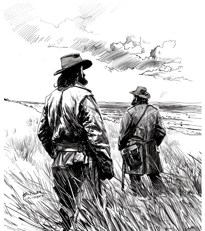
Lewis and Clark

The study of Lewis and Clark is a great example of the American spirit of discovery, curiosity, and adventure. It highlights our desire to be peaceful and make friends with others. Let's watch another episode of Star Spangled Adventures to learn more about the explorers Lewis and Clark and their journey out West.