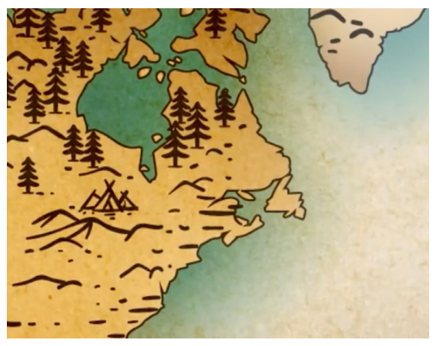
Map of the American colonies.

A long time ago, English explorers discovered exciting things in what was known as the New World, which we call America today. England wanted more land in the New World. They wanted to build colonies in the New World. A colony is a group of people from one country who build a settlement in a new territory or land.