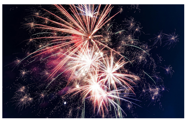
Fireworks are in full display on July 4th, the day we celebrate America's independence from British rule.

On July 4, 1776, the 13 colonies declared that they were independent states. This is our country's birthday, our Independence Day! The document that declared our freedom is called the Declaration of Independence.